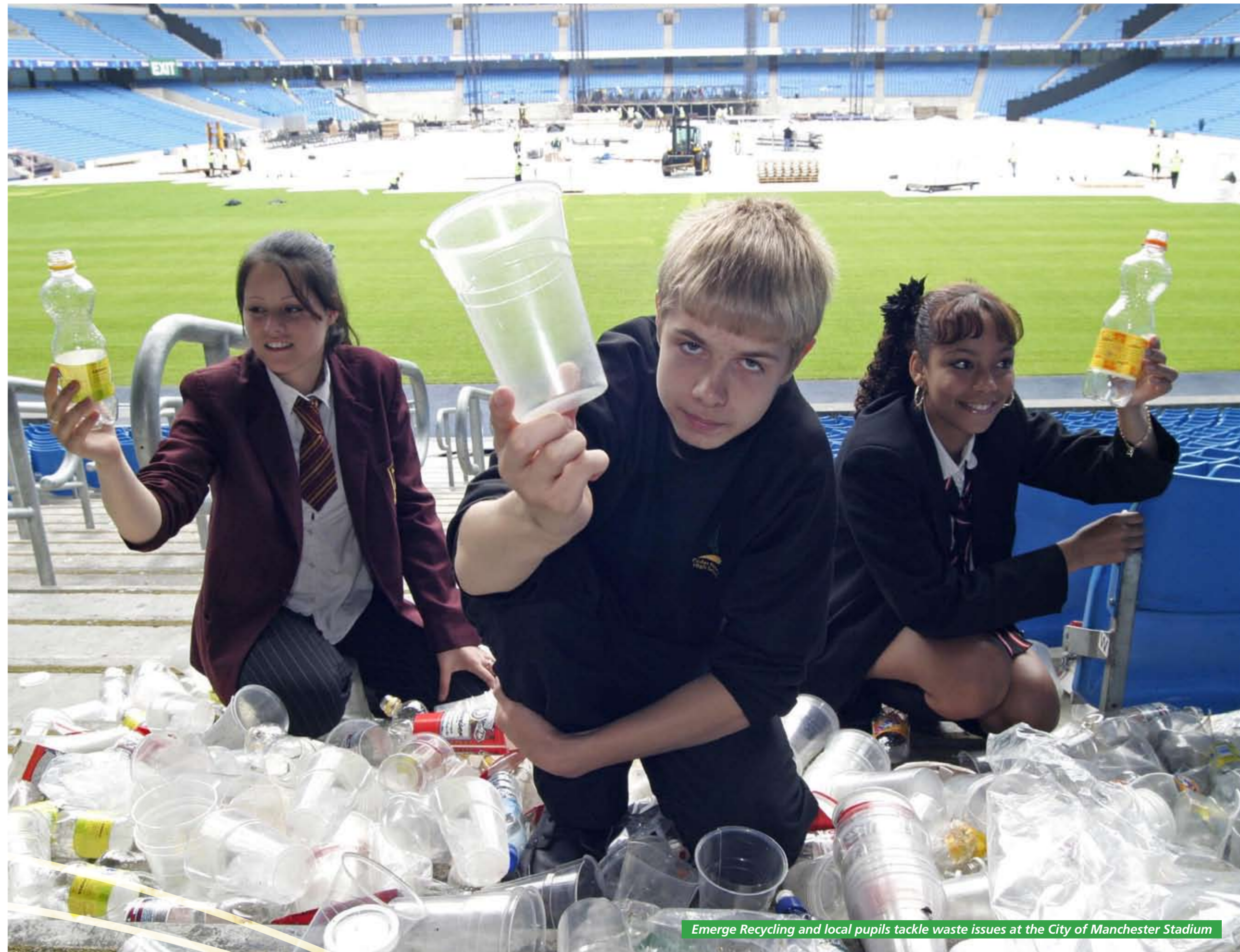
Emerge Recycling and local pupils tackle waste issues at the City of Manchester Stadium

DEP inspiration resources training for a just and sustainable world