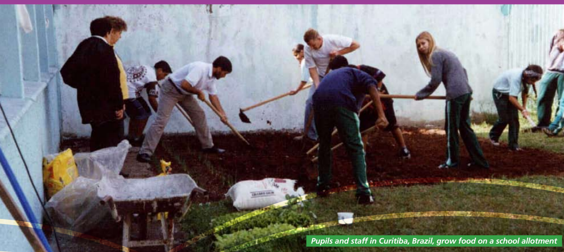
Pupils and staff in Curitiba, Brazil, grow food on a school allotment