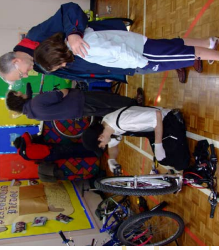
A cycle maintenance workshop in Beaver School, Oldham

Yaparamma aims to empower and enable personal, social, community transformation, growth and development through positive engagement and participation in the Arts. Email: info@yaparamma.co.uk Website: www.yaparamma.co.uk