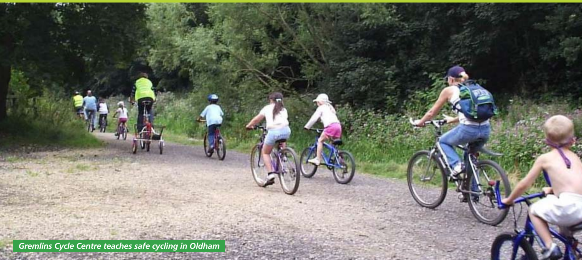
Gremlins Cycle Centre teaches safe cycling in Oldham