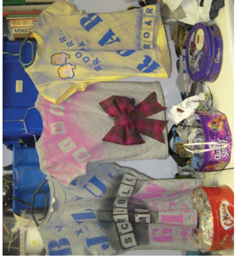
Samples from a Street Style Surgery fashion workshop